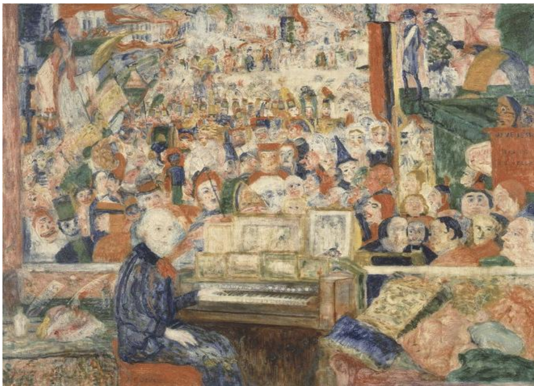
Figure 7: James Ensor, Self-portrait at the Organ , 1933, oil on canvas