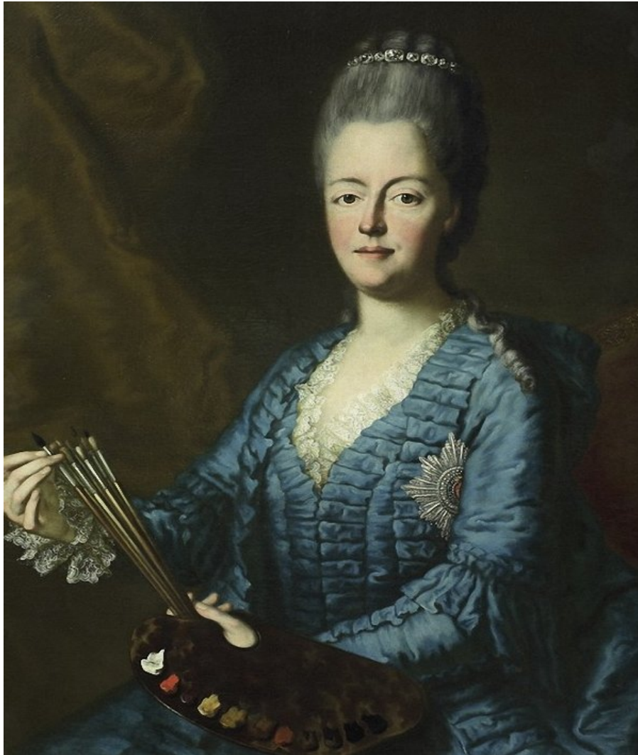
Figure 10: Maria Antonia of Bavaria, Self-Portrait, c.1770, oil on canvas

want to assert the “weak” self, the one that needs to be given some help by asserting it.