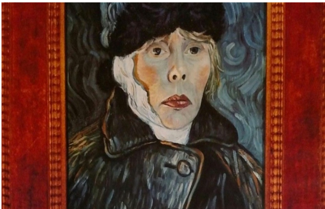
Figure 13: Joni Mitchell, Turbulent Indigo (Self-Portrait as Van Gogh) , 1994, oil on canvas

Patti Smith, David Byrne, and Joni Mitchell because the three of them excel in their musical output and their artistic (visual) output, and specifically their self-portraits seem outstanding. In the following instance Joni Mitchell dialogues also with another well-known self-portrait by Vincent van Gogh 13 . On her website, Mitchell states that in the early 1990s, she felt “undervalued... I was very frustrated at that time because the normal outlets for getting your product marketed in my business, those doors had been closed to me, early no one could give me a reason why... So, my work was being rejected whereas mediocre work was being accepted and elevated on the basis of newness and youth and, you know, obvious mercantile speculation ran in that direction. So, rather than physically cut my ear off, I did it in effigy” 14 .