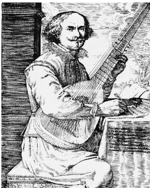
Figure 3: Bellerofonte Castaldi, Self-Portrait , 1622, engraving

[Others yet labor in medicine, That to me seems a foul and vulgar profession, Or buy and sell in the common crowd That wretched and wicked in justice, Or in philosophy by the dozen, Or still theology in the Hebrew language, I want none other than musical delight To write every hour with the theorbo at my breast.] 6