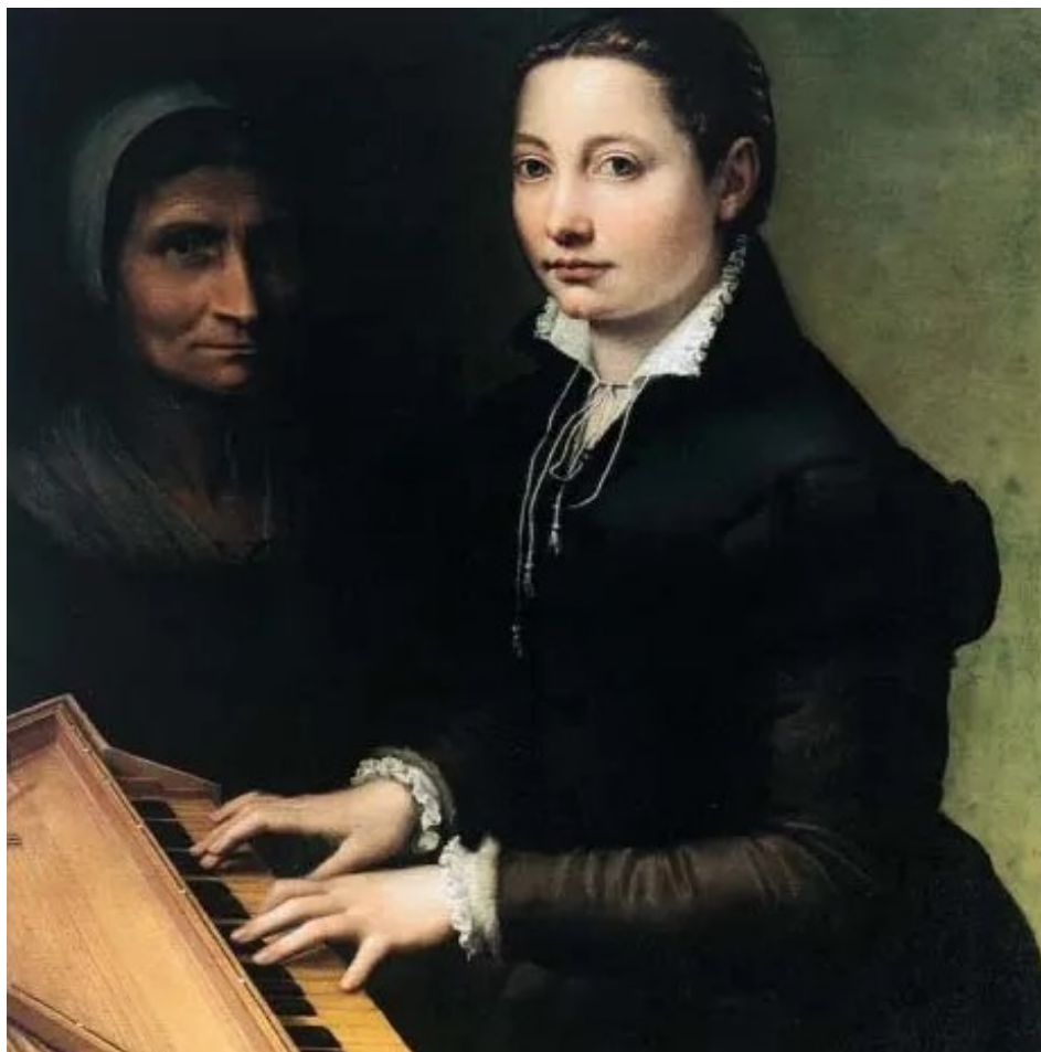
Figure 11: Sofonisba Anguissola, Self-Portrait at A Spinnet , c.1555, oil on canvas