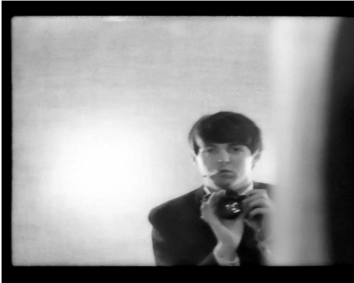
Figure 12: Paul McCartney, Self-Portrait , 1964 (cropped), photography

in the following example, sets a dialogue with the tradition, set forth by Parmigianino, of self-portraiture using a mirror 12 . What seems relevant right now is that these kinds of self-referential use of the camera is a direct precursor of the selfie, currently the most common type of self-portrait. McCartney's self-portrait, having also been a herald of celebrity and influencer culture, is especially poignant in that sense.