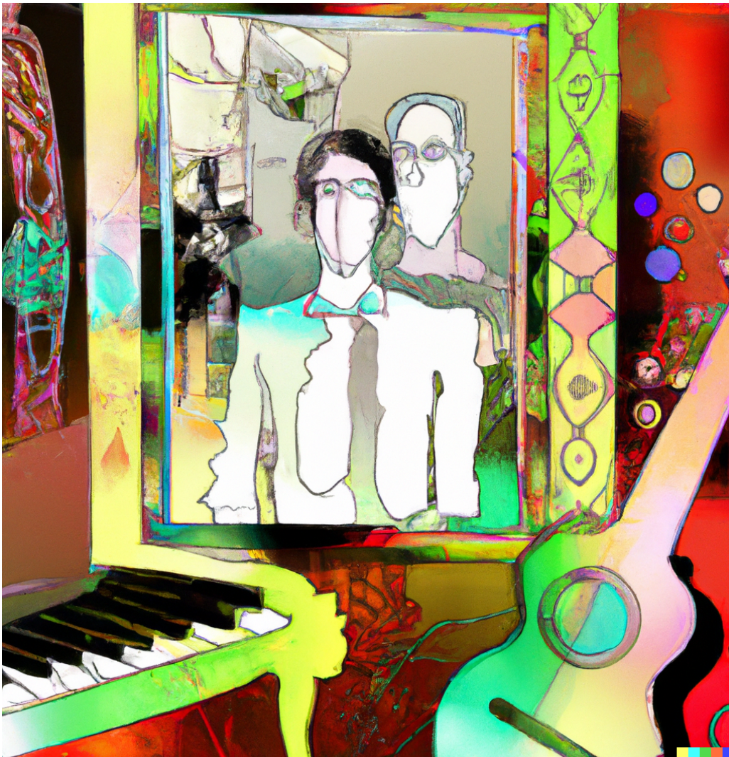
Figures 16-20: DALL E generated “musicians’ self-portraits”