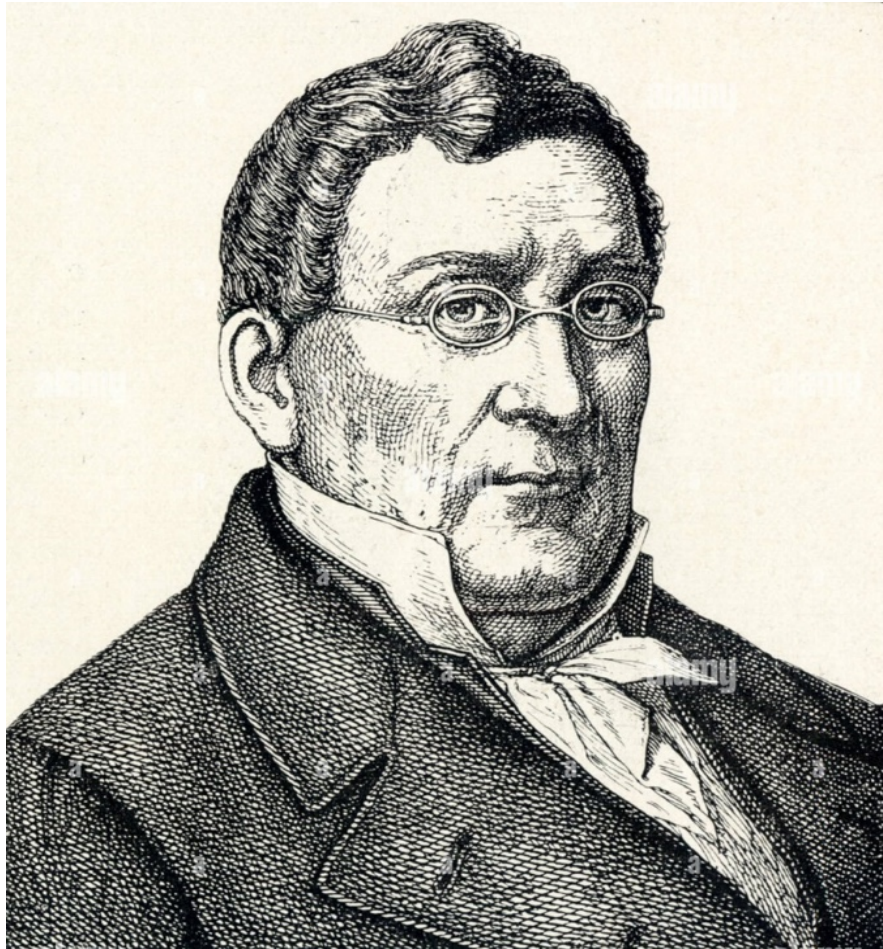
Figure 5: Louis Spohr, Self-Portrait , n.d., gravure

portraiture provided him with an opportunity to present a unified, coherent self. As a matter of fact, Castaldi is not alone in this general use of autobiography and self-portraiture. Many other musicians who painted self-portraits were also prolific autobiographers, writers, entrepreneurs, adventurers, etc. Such is the case of Louis Spohr and E.T.A. Hoffmann 7 . They all share a life full of events that must be told as if were, but a self that is spread perhaps too thin and that needs to be reined in in writing (autobiographies and diaries) or in the visual arts (self-portraits).