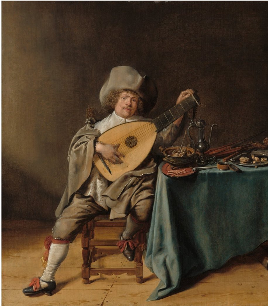
Figure 8: Jan Miense Molenaer, Self-portrait as A Lute Player , 1637-38, oil on panel