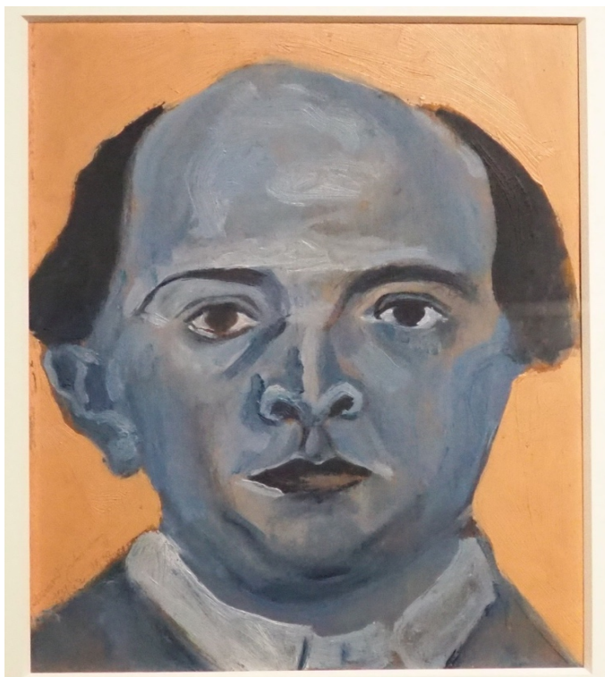
Figure 1: Arnold Schoenberg, Blue Self-Portrait , 1910, oil on panel

And yet, there are instances in which the categories are essentially clear. Take for instance Arnold Schoenberg (1874-1951) 2 . Mostly known nowadays as a composer, he was also an avid artist and more specifically a prolific self-portraitist. His many painted self-portraits have been exhibited and studied widely. Many of them show him from the head up in a monochromatic hue and expressionist technique. The canvas shows mostly the face or, at most, the head. There are no musical attributes—a score, a piano, or any other instrument; nothing indicates the subject is a musician. What counts, apparently, is the thought, the idea, and the thinking subject. These are self-portraits that project not so much an artist, a creator of soundscapes, or even a maker of images, but a thinker.