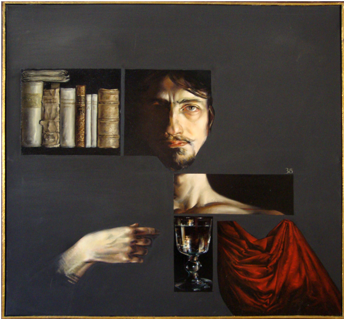
Figure 14: Federico M. Sardelli, Self-Portrait , 2001, oil on linen

musician, musicologist, and comedian Federico M. Sardelli. In the following image, he represents himself as a character from the Baroque period. As a baroque music scholar, with many publications on Vivaldi and others, and as an early-music active performer, this image questions the seriousness and self-importance often attributed to early music and historical performance. The reference to Jesus could also be construed as questioning the early music practitioner as a purveyor of absolute truth.