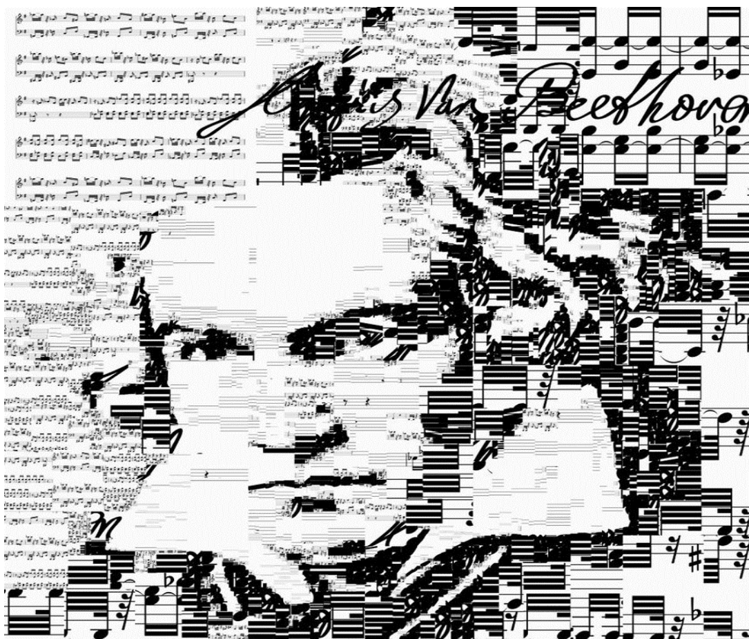
Figure 15: Sergio Albiac, Beethoven's Self-Portrait , n.d., digital

produced many portraits (some of them he considers them “self-portraits”) of famous writers (Rimbaud) and classical composers (Beethoven). He uses “bits and pieces of their manuscripts, music sheets and calligraphic signatures...” A computer, trained with these elements, generates an image, which can be considered a self-portrait 15 .