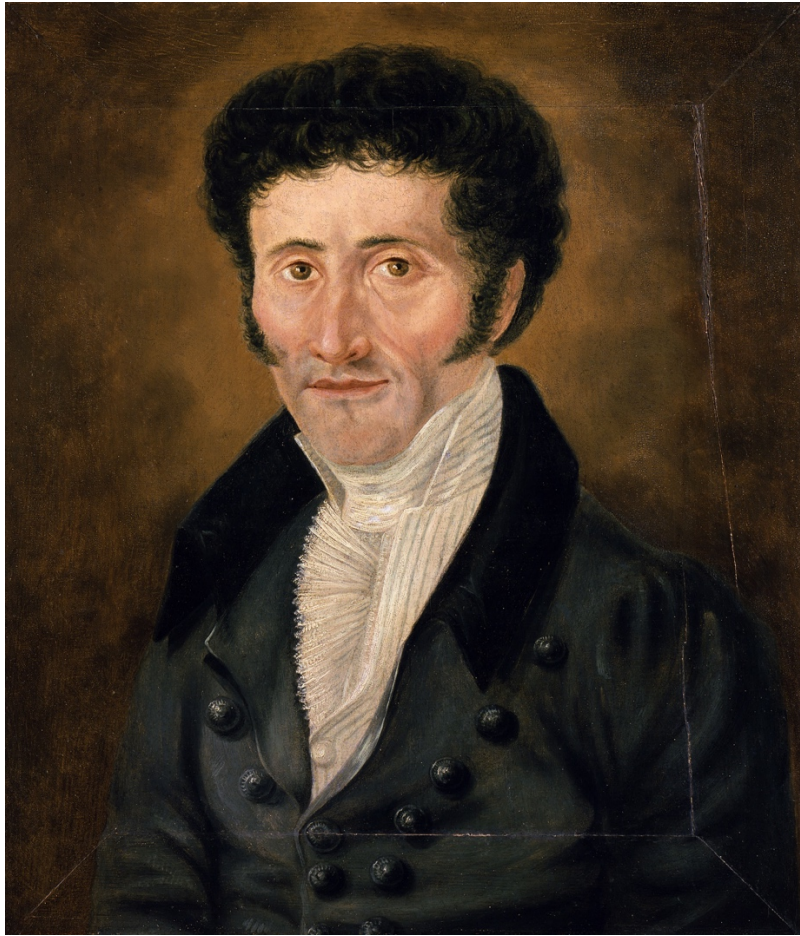
Figure 6: E. T. A. Hoffmann, Self-Portrait , n.d., oil on panel