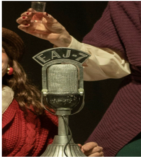
La anémona y el jabalí

woman emerging after the Spanish Civil War ended became a silenced identity whom –like Shakespeare wrote on his last line of Venus and Adonis – was forced ‘to immure herself and not be seen’.