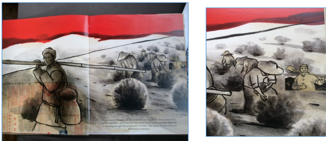
Figure 7. Leblanc, A. & Barroux (2009) The Red Piano [mixed media collage]. A double page spread in The Red Piano : soft, grainy black, grey and red pen-and-ink watercolour of workers in a field with text reading:

Anti-war literature can be a deeply serious business, but the collaborations between author and illustrator can offer counterpoint in these disparate juxtapositions. Author of The Red Piano (2009) André Leblanc actually met the inspiration for the story –internationally acclaimed classical pianist Zhu Xiao –Mei - and was shown the tiny little notebook she had kept secret in the camp with piano scores reproduced in her childish handwriting. He described the meeting as 'profoundly moving' and he decided to write around her experience, without naming her as she suggested. Leblanc shared photographic archival material with Barroux, the illustrator, plus images and commentaries by a Chinese photographer who himself spent years in a camp. He describes the difficulty of writing a fictional version of real-life events aimed at children, whilst the close collaboration with Barroux 'allowed a greater complicity: I let him carry the emotion and poetry, while I could write something more sober' (Leblanc interview, 2009).