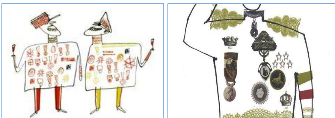
Figure 4. Cali, D & Bloch, S. (2009) The Enemy [pen & ink mixed media collage]

Two soldiers in army green peer out of holes, torn through the page as if by bullets. They are separated by a large expanse of white gutter. Each defends his position: “The enemy is there but I have never seen him. Every morning, I shoot at him. Then he shoots at me.” They are both hungry and exhausted. They are both hungry and exhausted: they each believe the other deserves to be so. In each case they believe the other deserves to be killed. He is a beast. (At least that is what the war manual says). Neither makes the first move. They wait, in an endless stalemate. Finally, one soldier sneaks out at night, ready to attack, so does the other, and they swap places. The enemy’s foxhole is exactly the same. They see scraps of family, friends, dreams. Why are they fighting? They have been conditioned. Artists Davide Cali and Serge Bloch break down war to its simplest element: the fact that it requires an enemy. What might it mean to communicate with one another? The photo-montage of sun behind a troubled grey and cloudy sky emphasise the enormity of courage to throw that message in a bottle.