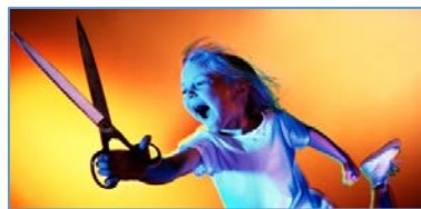
Figure 8. Unauthored internet image Scissors for thought [manipulated photograph]

Collage as it features in these picturebooks, is the play of representation and illusion, collapsing distinctions of high and low cultures, carrying the speed and dynamism of the machine age, odd rhythms, play of historical moments (the past pasted onto/under/over/beside the present), play of planes (flatness, surface, space, dimension) and sensations (tactile, hands-on, crafted, kinaesthetic). Just as Höch's picturebook pushes the boundaries of what any of us might imagine to be animal, vegetable or mineral; what Rona Cran (2014, p. 12) calls 'the continuous cross-pollination of discrete fragments', The Bomb and the General , The Enemy and The Red Piano present a postmodern rejection of rationality and coherence with respect to war. Collage effectively attacks the possibility of single histories rationalising war, by deliberately choosing the medium of deleting, shifting, rapidly changing, chopped up soundbites of meaning. What new collage picturebooks might emerge into our turbulent and unstable C21st? The scissors are out!