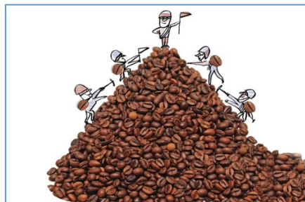
Figure 6. Bloch, S. (2015) Battle of the Bean, illustration for Los Angeles Magazine

For Stokes, both the whole and part can co-exist on and in this layered surface of collage, if ‘fitfully’. Thus, atoms, capable of unspeakable human acts of terror in fission are also capable of moral action in part. In rebellion the atoms unpick themselves like embroidery from the ominous black ink forms of the atomic bomb. Consequently, when war is declared, the bomb cannot explode and the general has to become a hotel doorman, ‘to make use of his uniform with all the braid,’ opening the door for tourists, former enemies and ‘even the soldiers whom in the old days the general had ordered about.’ Poetic justice and a happy ending this time, but also perhaps a reminder of the lack of order in modernity, and the (collage-like) instability of the nuclear.