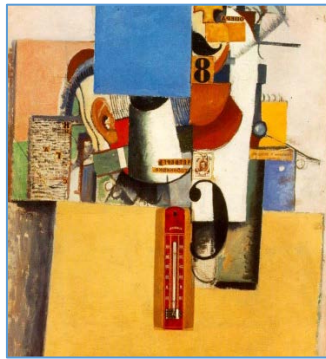
Figure 2. Malevich, M. (1914) Private of the First Division [oil on canvas with collage of printed paper, postage stamp, and thermometer] New York: MOMA

Malevich's collage titled Private of the First Division (1914) brings together letters, words such as 'Thursday', 'President', 'snuff box', images such as an ear, a military cross, blank squares and a thermometer, and thus requires the viewer to float around disconcerting realities. It has an immediacy and spontaneity; it is both raw and refined. Russian art of this time channelled the disruption, deconstruction and displacement in materials as a direct reaction to Russian involvement in the First World War, and collage was the medium to express this.