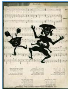
Figure 1. Hans Christian Anderson (c.1859) [paper cut-out on music score]

Collage has a long, largely untold history of the craft and ritual assemblages and religious folk art from many cultural traditions and native peoples, women and children. Other than these, collage came to the west via C12th Japanese calligraphic poems on torn and pasted sheets of paper, scraps of leather and paper in C13th Persian bookbinding, Mexican garments decorated in beads and feathers brought back in the C16th from the New World by explorers, and an C18th trend for hand-crafted Valentine's cards and fans. In western Europe from the C19th onwards, collage began to particularly interest those working with children, exemplified by educationalists Rudolf Steiner, Friedrich Froebel and Maria Montessori's creative approach to materials, or children's writer Hans Christian Andersen's collage and paper cut books.