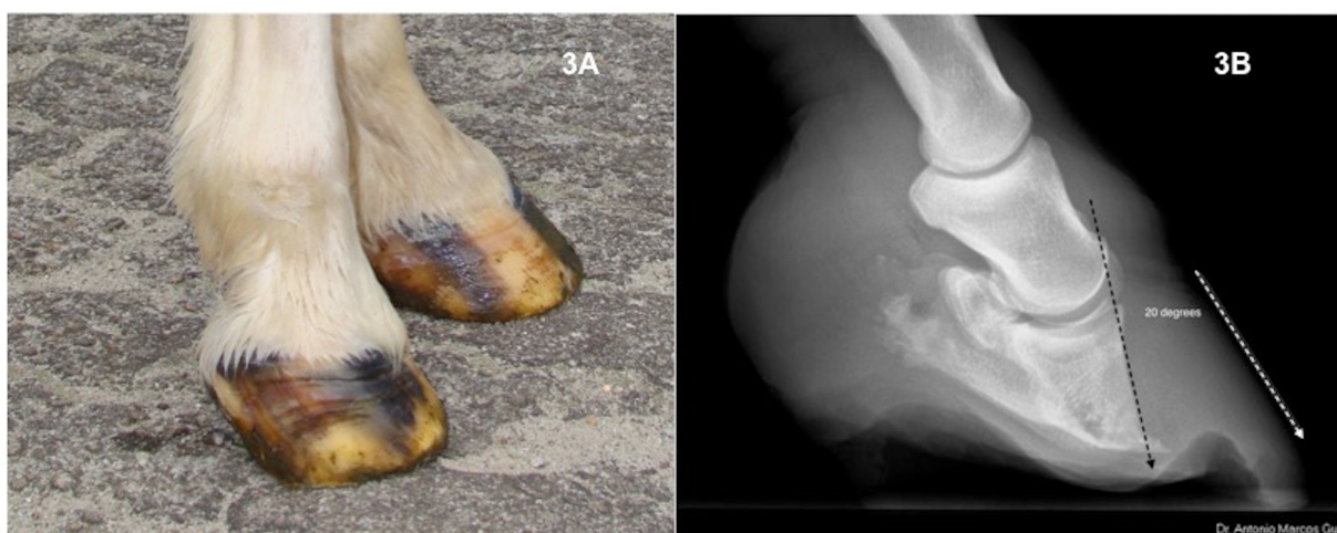
Figure 3. (A) The same hoof after 2 months of treatment with trimming and oxygen / ozone therapy. (B) On the radiographic examination it's possible to observe a reduction of the lesion to 20 degrees.

On September (2 months after the beginning of the treatment) the resin was removed. Growth of the hoof wall was sufficient for weight bearing (Figure 3A). On clinical evaluation, heart rate was 36 bpm and the sole had a concave appearance and the pain