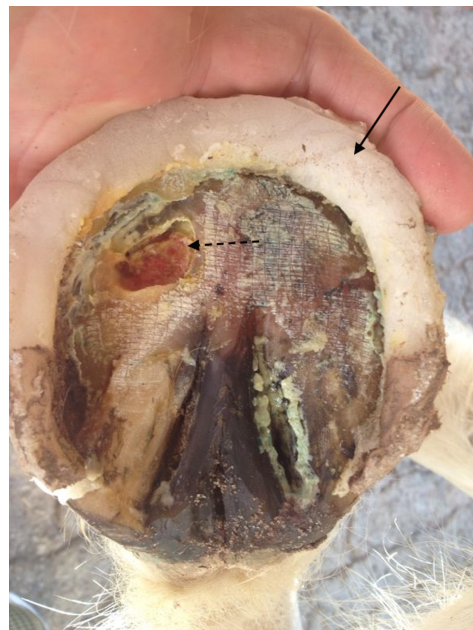
Figure 2. Image of the sole of the right front foot where it is possible to observe the resin attached to the toe, as an extension (thin arrow) and the abscess point (dashed arrow).

On July 30th, an abscess was detected on the sole region of the right foot and it was treated with