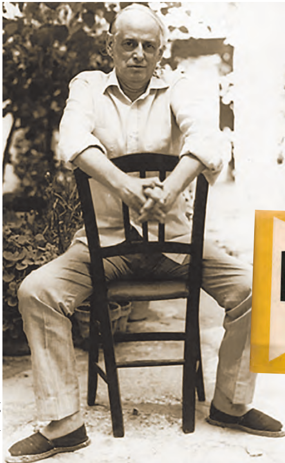
Blai Bonet photographic archive. Mallorca Literaria Foundation

And I want to love beauty, I want to love doing what I do for fun and pleasure