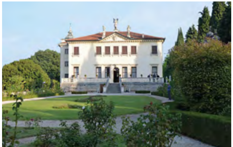
Figure 2. In most cases, the locations chosen for the consultation were also meant to convey a sense of neutrality in terms of scientific authority. In the picture, Villa Valmarana ai Nani, Vicenza, the location of the Italian CONCISE consultation.

The core methodological procedure of the research are public consultations with citizens of the five participating countries. It is through these consultations that citizens are engaged in the scientific process, contributing to the production of science by sharing their opinions, perceptions, and suggestions to improve science communication.