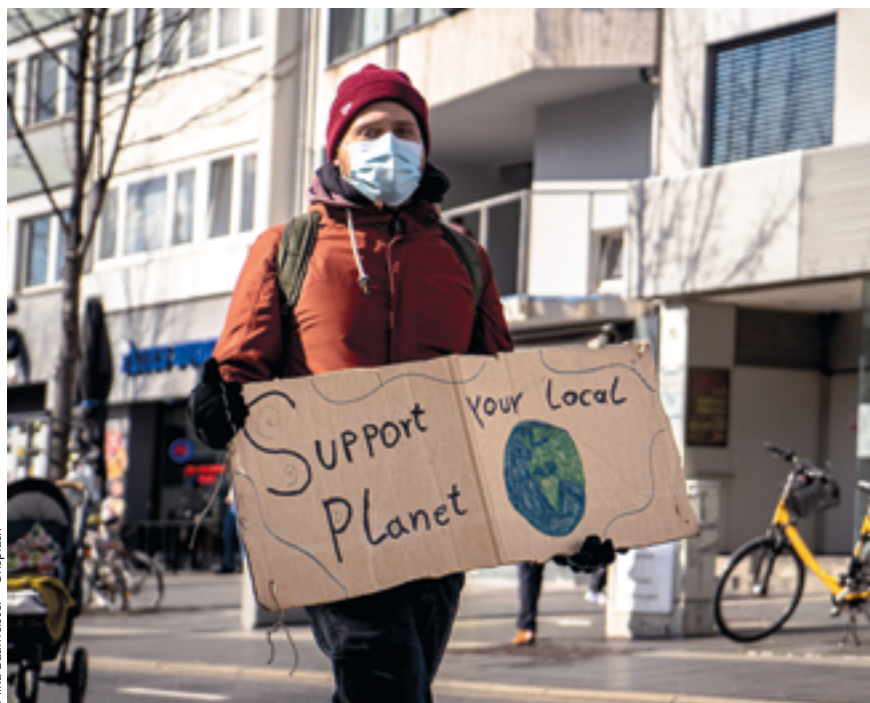
Mika Baumeister - Unsplash

Biodiversity supports ecosystem services for mitigating heat, noise, and air pollution, all of which trigger positive health effects in well-preserved