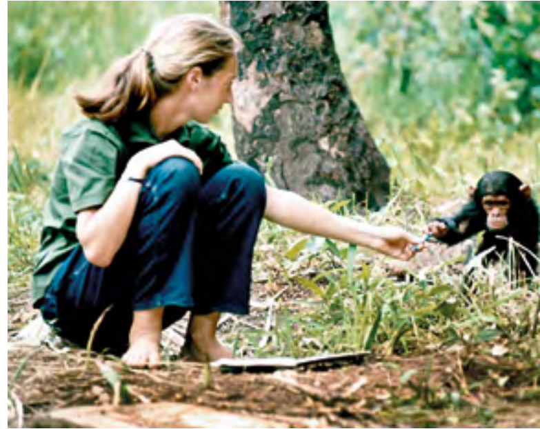
The study of chimpanzees in their natural habitat began in 1960 with the pioneering project led by palaeontologist and archaeologist Louis Leakey. As a result, Jane Goodall then spent decades among wild chimpanzees in Tanzania's Gombe Stream National Park. The image shows Jane Goodall with the infant chimpanzee Flint.

This diversity in behaviour has mainly been explained by the ecological characteristics of