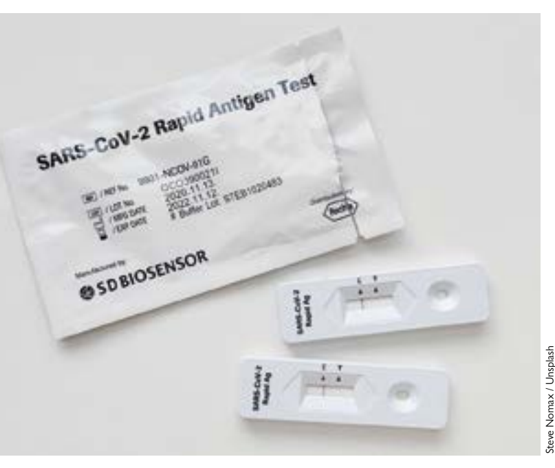
Figure 2. One of the most popular and well-known optical biosensors is the lateral-flow assay (LFA) test. These devices have been broadly used by the society for decades, for example for pregnancy detection and, more recently, for self-diagnosis of COVID-19.