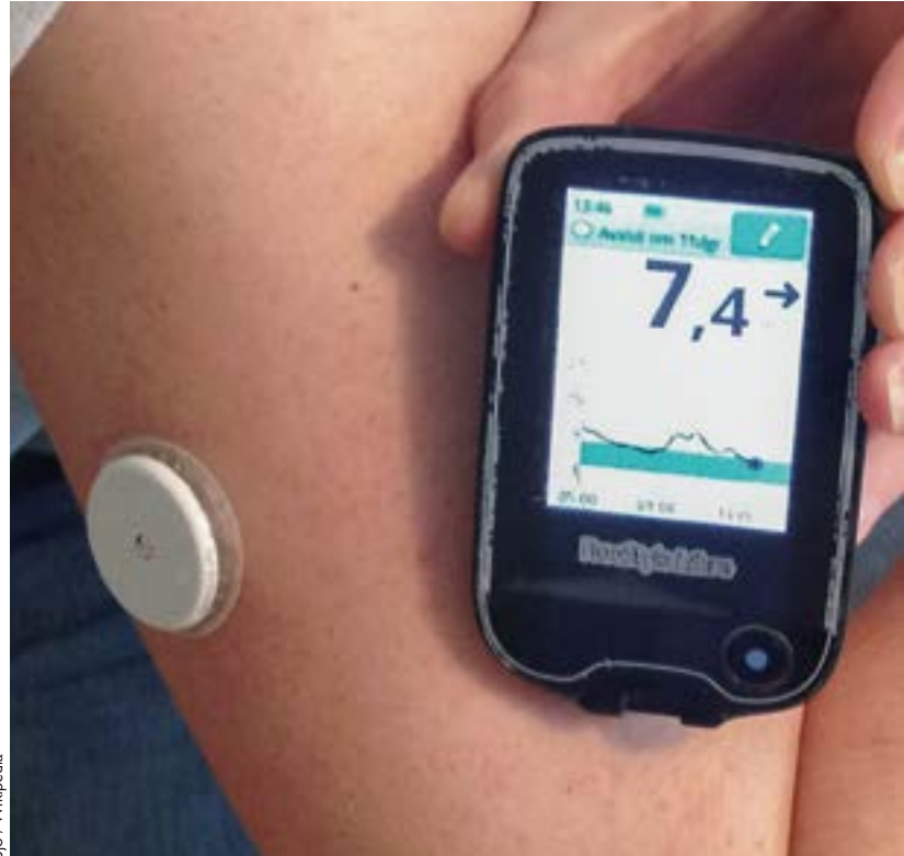
Figure 3. Amid the rise of nanotechnology and microelectronics technologies, biosensors have seen a boost in miniaturization and integration. For instance, glucose biosensors have terrifically evolved until being fully integrated in wearable devices for continuous glucose levels monitoring with highly accurate performance, wireless connection and customized alerts, or even automated treatment administration.

Gold can be readily modified by chemisorption of thiol (SH)-functional molecules, a rapid and efficient reaction that creates strong and stable covalent bonds. The simplest approach is to directly immobilize thiolated receptors, such as thiol-functional DNA probes or antibody fragments. However, for antibodies and other protein receptors, the commonest procedure is the formation of functional self-assembled monolayers (SAMs) for subsequent crosslinking of the native biomolecule or affinity linkers (e.g., streptavidin, protein A/G) that might help in orientation. The formation of SAMs is also a wellestablished procedure that typically utilizes shortchain alkanethiols bearing a functional end-group (COOH, NH<sub>2</sub>, OH, etc.) that spontaneously attach on gold by chemisorption creating a highly ordered and dense matrix. Furthermore, SAMs can be formed by mixing different functionalities at the desired ratio,