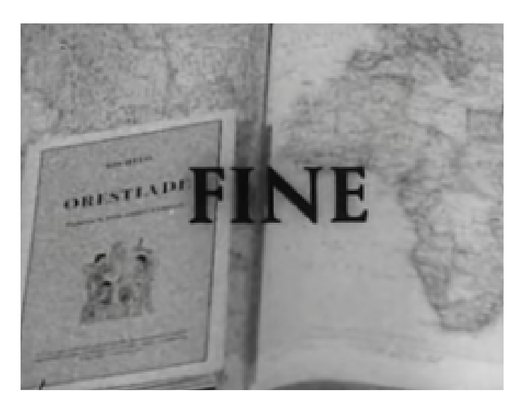
Fig. 15. Final shot of Notes of for an African Orestes

trate and expose the fundamental inadequacy of the tools at hand in the face of narrative catastrophe.