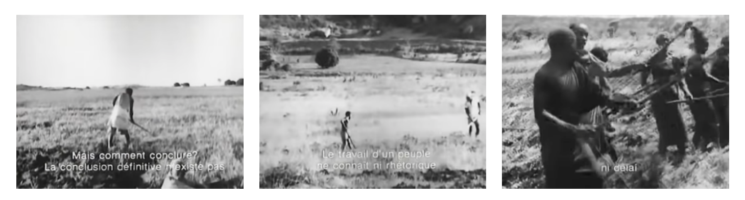
Fig. 12-14. Still from the end of Notes of for an African Orestes.

This setting of the camera and the intradiegetic commentary, which then becomes an extradiegetic voice,<sup>4</sup> is directly related to the fact that in these movies Pasolini's gaze turns towards the Global South in the process of decolonization, and that he is looking for possibilities of representing the unmaking of (t)his gaze within the framework of a temporally limited form. This elevation of the supposedly unfinished form to the ultimate state of creative work is intended, I argue, to demonstrate the impossibility of applying pre-existing narrative patterns to colonial contexts of capitalist exploitation, since the former are complicit in the latter. The "undoing of the plot" is, to borrow Saidiya Hartman's poignant formulation, necessary to counter the "plot of her undoing". As the opening scenes testify, this strategy sabotages the director's own neocolonial desire for a narrative imposed from a European point of view.