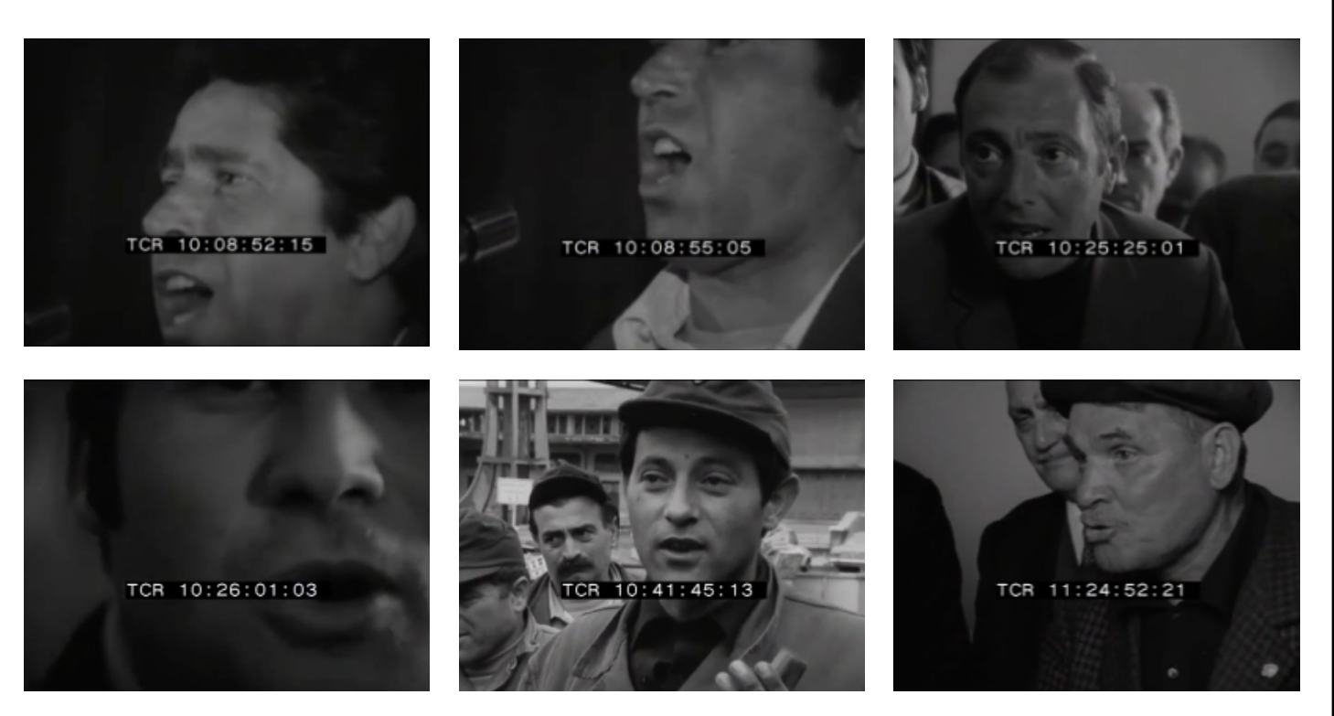
Fig. 16-21. Stills from Strike of the Waste Collectors.

between the artist and the people.<sup>7</sup> The end is again in standard Italian, more specifically in a marxist jargon ("è giorno di sciopero: l'Ordine degli Scopini / è entrato nella storia", "it is a day of strike: the Street Sweeper's Union / has entered history") mixed with religious terminology ("è giorno di Rivelazione", "it is a day of Revelation"). The mixture has an irresistible ironic and comic effect, which exposes the fact that in this discourse too the Lumpenproletariat is made the object of someone else's speech.