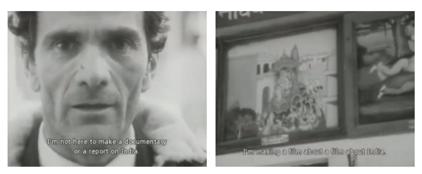
Fig. 6-7. Stills from the beginning of Notes for a Film on India.