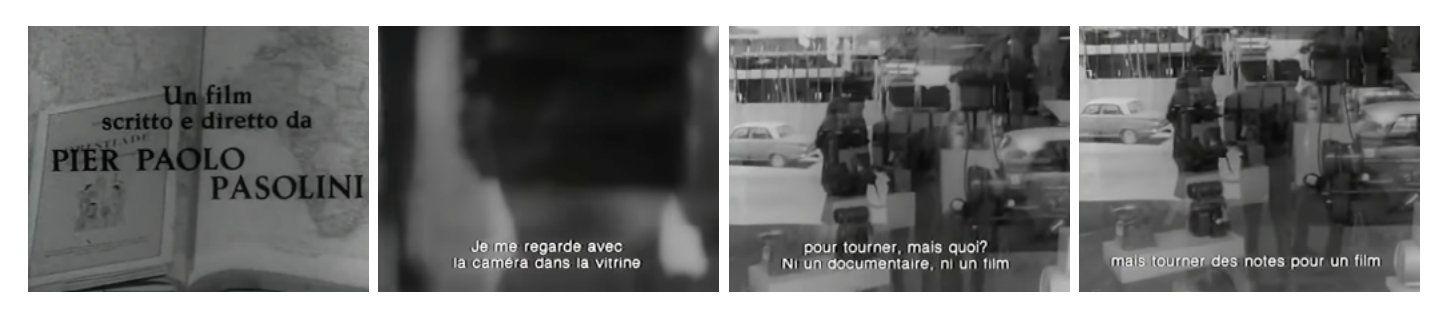
Fig. 8-11. Stills from the beginning of Notes of for an African Orestes.

Both films begin similarly, albeit in reverse order one with respect to the other. In the first we see Pasolini's face, in the second the back of his head, in the first we are looked at directly while receiving an oral explanation, in the second we look along. By watching Pasolini reflected in the shop window, we (or the Italian audience of the time) are not only shown "what is in front of the video camera and what is behind it at the same time" (Annovi, 149) but we also, and more significantly, mirror ourselves.