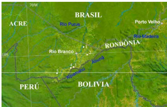
Fig. 1: Places cited in the text: 1) Nossa Senhora de Nazaré, 2) Chiquinho, 3) Piçarreira, 4) Xipamanú, 5) Santa Rosa.