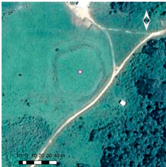
Fig. 2: Subquadrangular structure in Santa Rosa Colony (Reserva extrativista Chico Mendes).

more or less formal manner. Not only GE images, whose resolution is variable in this vast territory of the western Amazonia, are used. Some have also been found with other similar services like Apple Maps or Bing. Alceu Ranzi and Nakahara have contributed with an important number of structures to the current knowledge (Schaan et al. 2010). When an earthen structure is remotely localized it is labeled after the name of the person that have discovered it, some additional information related to their geographical position (RO = Rondonia and Amazonas = AM, or BO = Bolivia) is added to the name. One of the main drawbacks, of this method, is that there is not