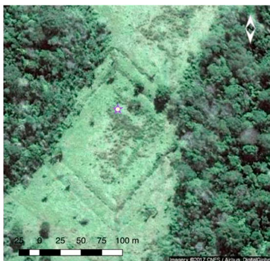
Fig. 4: Quadrangular structure in the Nossa Senhora de Nazaré Colony.

specified, is less than 1x1 m, compared to 2,5 cm x 2,5 cm of the Chiquinho one. In Tequinho and others structures some features beyond the limits of the main one, namely roads and paths (RampANELLI et al. 2017) have already been located.