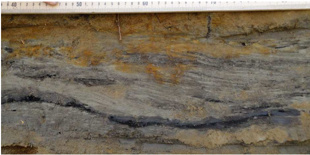
FIGURE 1. Sediments exposed along Arlington Canyon, Santa Rosa Island. Charcoal occurs as discontinuous layers as well as on the cross-set of sandy units and scattered in the sediments

fires with a limited amount of post-fire erosion and deposition through the sequence. We do not find evidence of 'mass wasting' following intensive fires at the 12,900 horizon as claimed by other authors (e.g. Kennett et al. , 2008) as part of their Younger Dryas impact theory (Firestone et al. , 2007). Quantification of charcoal as claimed by other authors in these sediments is difficult as many of the sediments contain pebbles from fan deposits so successive samples are not comparable. This is also made difficult because of the intermittent occurrence of the charcoal. While it is possible to imagine that there is an increase in fire through the early part of the sequence it is not possible to determine if this is human or naturally caused.