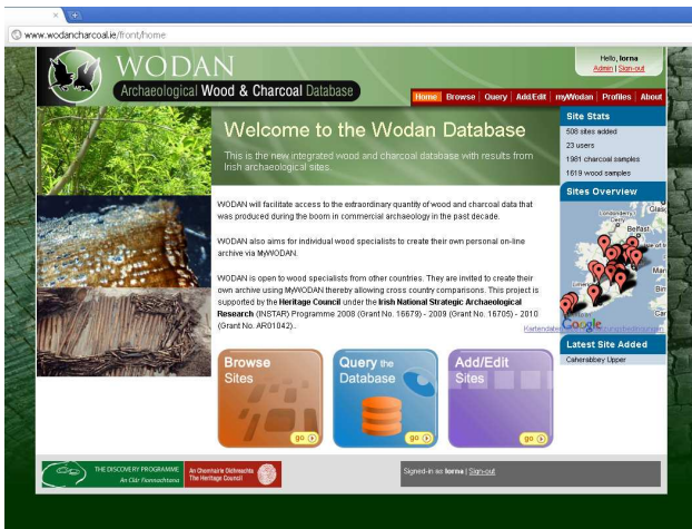
FIGURE 1. Introduction page to WODAN.

opportunity to use it. This led to crucial feedback from the intended user community, which was subsequently used to adjust structure and fields of the database.