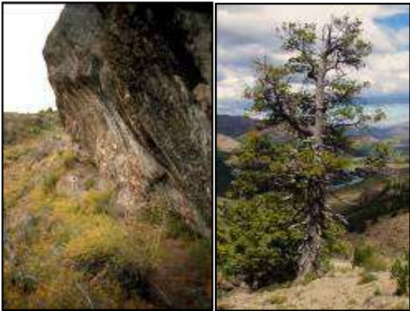
FIGURE 1. Left: Archeological site Cerro Pintado, Right: Austrocedrus chilensis tree.

significant value ( p < 0.01 ). This leads us to propose that the 2 charcoal fragments of the series CP002-03 cover the period 1733-1785 AD.