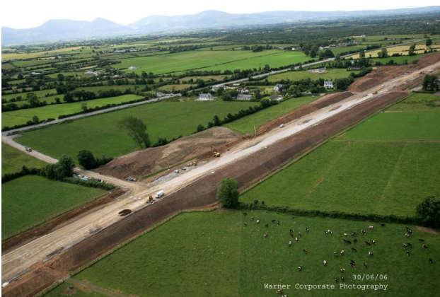
FIGURE 1 Segment of the N8 roadscheme.

There are three main types of site that date to the Bronze Age in Ireland, settlement, funerary and fulachta fiadh , all of which were found along the study route of the N8 (Mc Quade et al. , 2009) (Fig. 1). Fulachta fiadh are large troughs, which were sunk into wet areas or filled manually with water. They were used for cooking or bathing. Charcoal was sampled and analysed from thirty nine sites, securely dated to the Bronze Age. Complimentary plant remains and bone results are available for all of the sites, and were used to provide an interdisciplinary assessment of the way people interacted with their local landscape. The thesis was undertaken to examine cultural, functional and random reasons for the selection of trees for different purposes in Bronze Age Ireland.