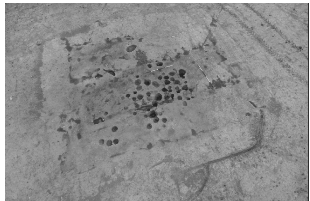
FIGURE 2. Early/Middle Bronze Age flat cemetery at Templenoe, Co. Tipperary (After Doody, 2008 Plate 1).

The largest Bronze Age flat cemetery ever excavated in Ireland was found at Templenoe, Co. Tipperary within the study area (Fig. 2). It was composed of 76 cremation pits, 54 of which contained cremated bone and three possible pyres. This site was fully sampled, to examine temporal and spatial changes in charcoal throughout the cemetery. This provided an exciting opportunity to examine the use of fuel for the process of cremation.