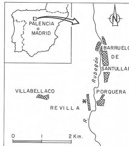
Figure 1: Situation sketch. * outcrop yielding the crinoid specimen.

Material: A single calyx deposited in the collection of the Instituto Tecnológico GeoMinero de España, Madrid (Catalogue No. 8.125).